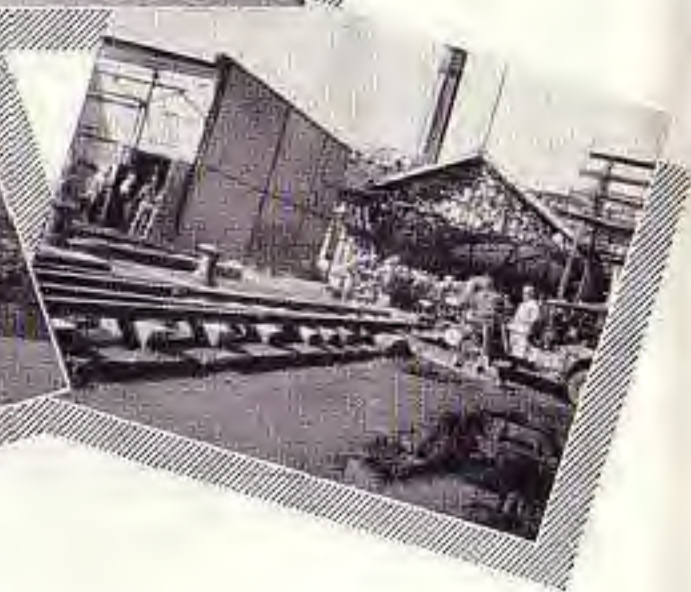
SURDON — FRANCE